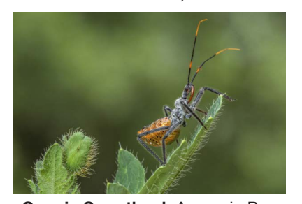
Connie Sweetland, Assassin Bug