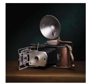
Kirby Turnage, Polaroid Model 95