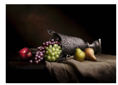
Kirby Turnage, Bounty