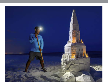
Gail Barsh, Night Construction