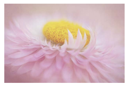
Connie Sweetland, Floral Dream-Straw Flower