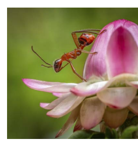
Connie Sweetland, Ant Mimic