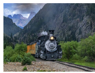
Yvonne Lashmett, Coming up the Canyon