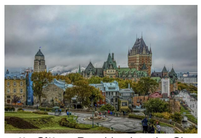
Loretto Sitton, Reaching into the Clouds