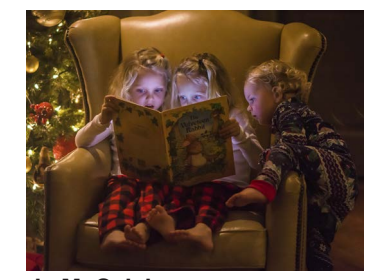
Glenda McCaleb, T'was The Night Before Christmas