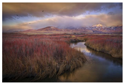
Kirby Turnage, Owens Stream