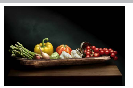
Kirby Turnage, Untitled